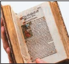
The Tyndale Bible 1526

Wycliffe produced hand-written Bibles in English. Condemned as a “heretic,” Wycliffe was excommunicated by the “Church” for making the Bible available to the common person. After his death religious authorities ordered his bones dug up and burned. His ashes were scattered across the River Swift.