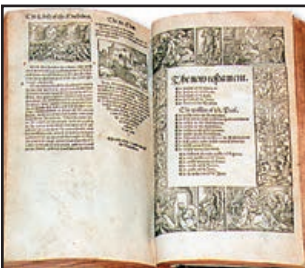
The Coverdale Bible 1535

The “father of the English Bible,” Tyndale was the first to print the New Testament in English. He was exiled, imprisoned, strangled and burned at the stake on October 6, 1536. He prayed: “Lord open the eyes of the king of England!” Three years later Henry VIII ordered that a copy of the Bible be placed in every church in England. It is estimated that up to 90% of the King James Version is the vocabulary and style of Tyndale.