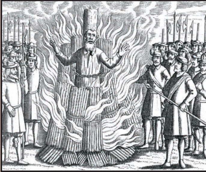
JOHN BAINHAM, A CHRISTIAN, BURNED AT THE STAKE IN LONDON, ENGLAND 1532

It has not always been easy to read the Bible. Courageous men and women died because they read and taught the Bible in English.