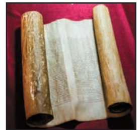
18th Century Esther Scroll on parchment

Important records were inscribed on parchment (sheep) and vellum (calves). Among Jewish people, these were clean animals (Leviticus 11:3). After the 4th Century A.D. scriptures were usually preserved on parchment or vellum. It required the skins of 170 calves or 300 sheep to make a single hand-written copy of the Bible! Scribes would use 80 quills a day to create a Bible scroll.