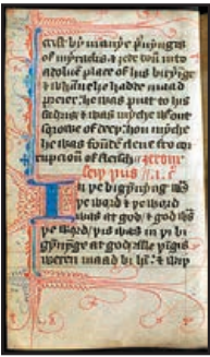
The Wycliffe Bible 1382

“That the New Testament is of full authority, and open to understanding of simple men, as to the points that have been most needful to salvation .... That men ought to desire only the truth and freedom of the holy Gospel, and to accept man’s law and ordinances only in as much as they have been grounded in holy Scriptures.”