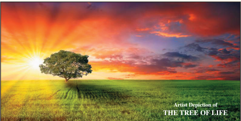
Artist Depiction of THE TREE OF LIFE