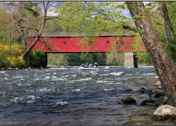
HOUSATONIC RIVER AT CORNWALL BRIDGE, CONNECTICUT

The Housatonic River rises from pure sources in Western Massachusetts and flows southeast to empty into Long Island Sound. It's waters cascade over rocks and meander the valley of the Berkshire Mountains. Mohican and Algonquian tribes once fished its ideal waters and built wigwam villages along its shores. Today New Englanders admire the beauty of rapids, rowing teams and fall foliage in the hills. It is the destination for trout fly-fishing. Three covered bridges still span across it.