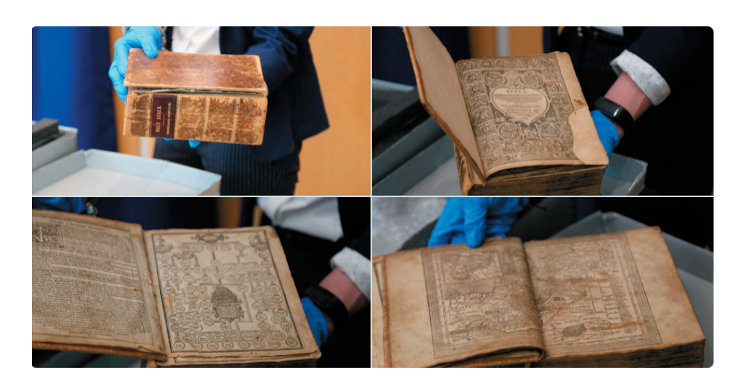
A 400 year old Bible, stolen from the Carnegie Library in the 1990s - one of more than 300 items taken over the course of more than two decades, was found at a Dutch museum and is now back in Pittsburg, Pennsylvania.

Our culture's view of the Bible has changed dramatically from positive to negative in a relatively short period of time. In the not too distant past the Bible was generally regarded as the authoritative word of God, useful for finding the answers to life's great questions. What is man's origin? Does my life have a purpose? Is there life after death? Does God exist? The culture has increasingly rejected the answers the Bible gives to these questions. There is a growing acceptance of the view that: man is the product of a mindless process of evolution, right and wrong are totally subjective, there is no God, there is no afterlife, and truth itself is relative. Your truth is not my truth. We are no more than a complicated combination of chemicals, and thus our actions totally determined by physical forces making free will only an illusion. Science has successfully ex-